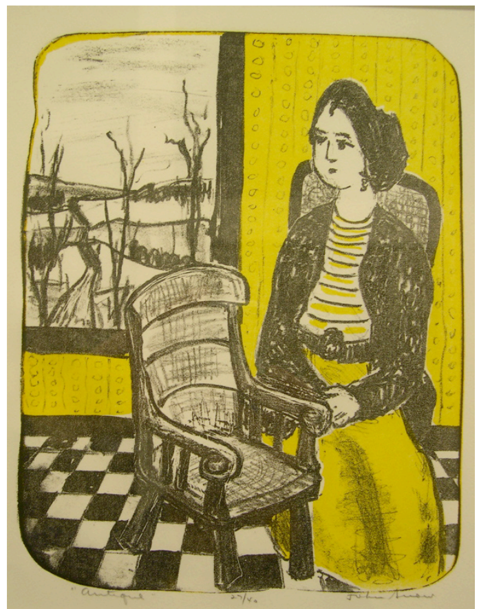
John Snow from the exhibition Checkerboard & Other Patterns Antique 1973 Lithograph on paper Prairie Art Gallery collection