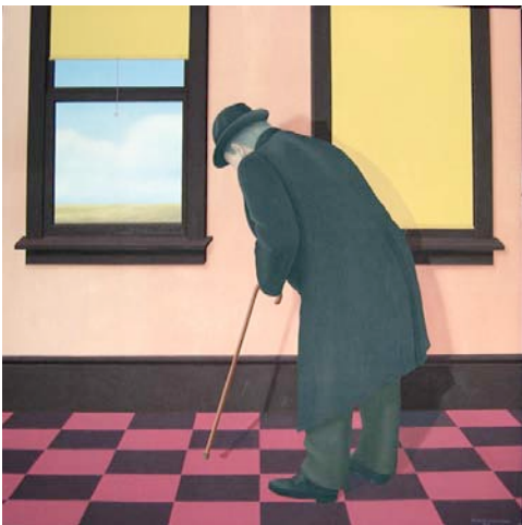
Daniel Campbell The Oracle 1986 Oil on canvas Prairie Art Gallery collection