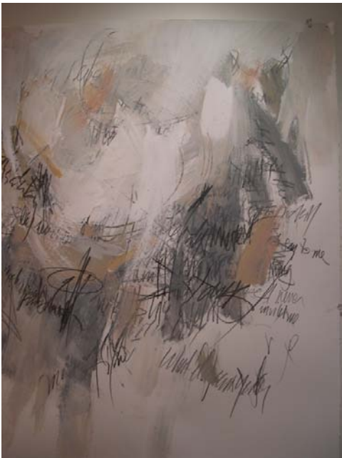
Ann Manuel His Last Breath 2007 Conté and acrylic on paper Courtesy of the artist