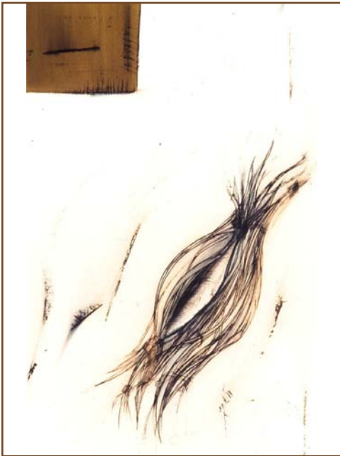
Catherine Hamel Adaption #3 2003 Ink and wash on paper Courtesy of the artist