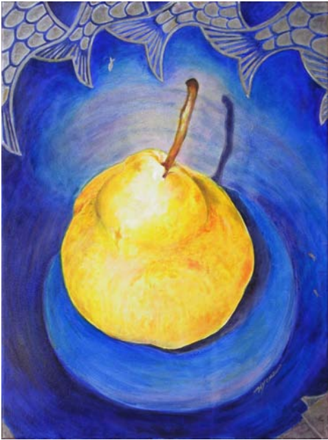
Hyoko Baxter Can You Swim? Oil on canvas