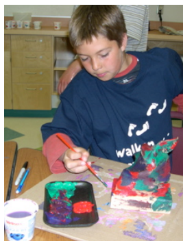
Clairmont School Gr. 5