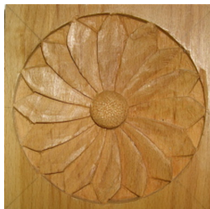
Flower, Wood carving