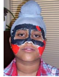
Maskmaking Gr. 6,