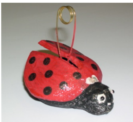
Lady Bug modeling clay