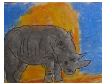
'Animal Drawing' Gr. 5/6