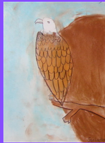
'Animal Drawing' Gr. 5/6 Helen E. Taylor School