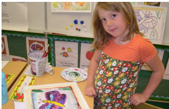
St. Gerard School Gr. 1