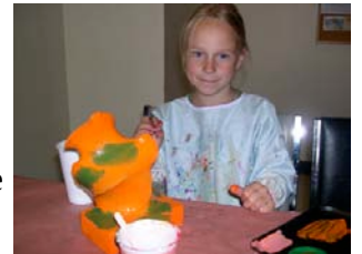
'Abstract Wire Sculptures' Home School Program

Paint sculpture to express feeling, mood, pattern and texture.