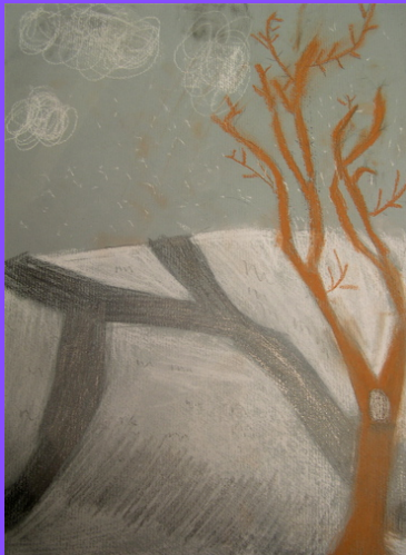
'Drawing Trees' Gr. 6 Swanavon School

for bookings email lynn@prairiegallery.com