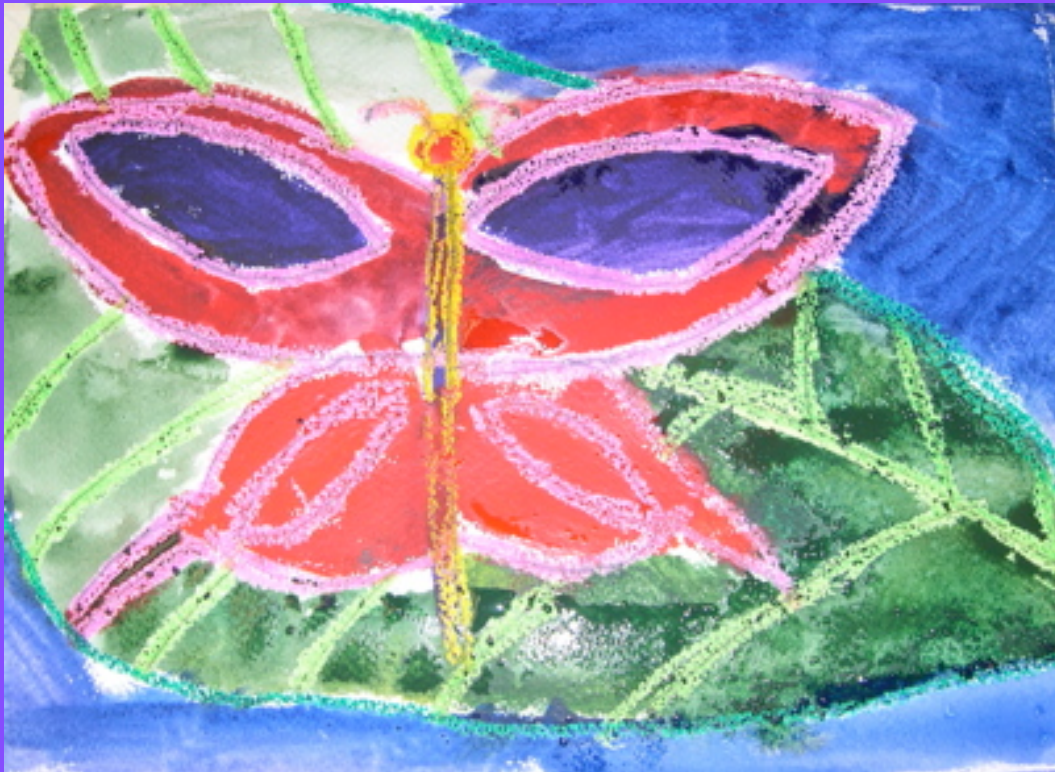
St. Gerard's School Gr. 1 'Butterflies' (watercolour resist)