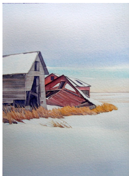
Winter Scene - Graineries