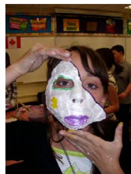
Avondale School Gr. 6