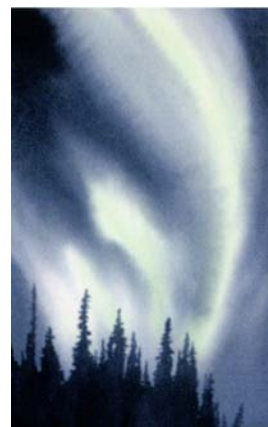
The Northern Lights