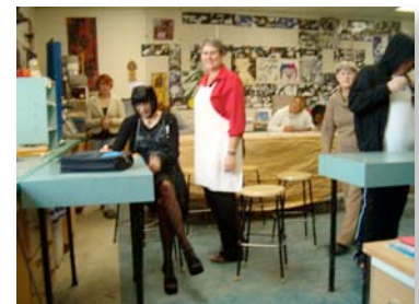
Encaustic, Beaverlodge High school

Teaching Time: 2 hours; need 3 supply tables with plug-ins for hot wax pans.