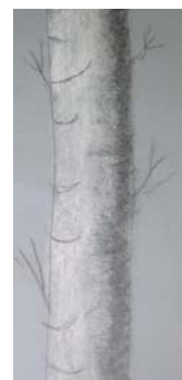
Drawing Trees Gr. 6 Swanavon School