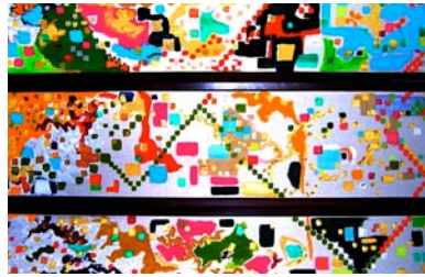
I knew we would be friends