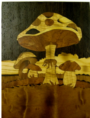
Mushrooms, Wood Marquetry