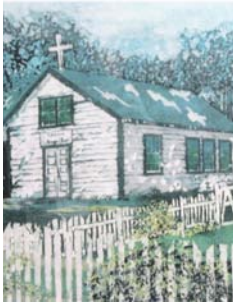
Emmanuel Luthern Church - Goodfare