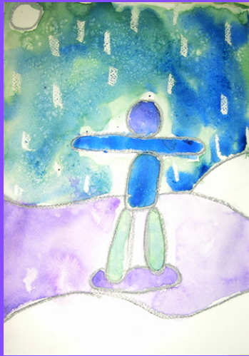
'Inukshuks' Gr. 3 Derek Taylor School