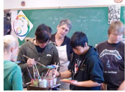
Encaustic, Beaverlodge High school