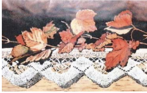
Cranberries and Lace